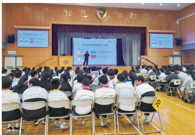
學院為中學生舉辦講座「公民教育 X 義工領袖」，分享義務工作的正面價值觀和公民意識 IoV organised a seminar for secondary school students, themed 'Civic Education X Volunteerism', to share the concepts of volunteer service, positive values and civic awareness

The Specialised Training Programmes are customised to meet the specific needs of individual organisations in both online and offline mode. These programmes cover volunteer basic concepts, service skills, leadership development and volunteerism management for volunteers, volunteer leaders and management staff. In the year, 105 units were served, including the Hong Kong Monetary Authority, the Immigration Department, Bank of China (Hong Kong) Limited, The Hong Kong Chartered Governance Institute, The Kowloon Motor Bus Co. (1933) Ltd, The Chinese University of Hong Kong, Lingnan University and The Education University of Hong Kong. All training programmes were conducted by qualified and experienced staff, along with volunteer trainers, to ensure high quality training.