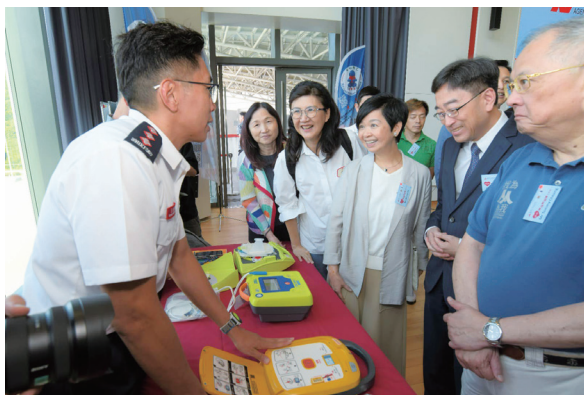
「救心同仁」培訓講座 CPR and AED Training

Meanwhile, IoV organised a series of seminars and workshops to raise public awareness of 'Mental Health'. The speakers included clinical psychologist, psychiatrist, psychiatric nurse, physiotherapist and social worker. The topics covered included 'Mental Illness of Teenagers', 'Schizophrenia', 'Dementia', 'Emotional Disorder Management', 'Physiotherapy and Pain Management' and 'Cherishing Life', attracting over 800 participants in total.