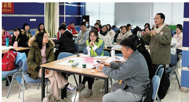
為廣州市志願者協會提供義務工作管理培訓 Volunteer management training for Guangzhou Volunteers Association