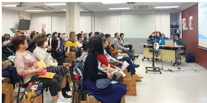
「明辨資訊真偽 — 做個精明 Fact-checker」專題講座 'Distinguishing Authenticity of Information - Be a Smart Fact-checker' Seminar