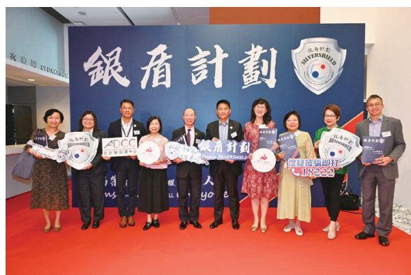
「銀盾計劃」防騙培訓講座 'Project SILVERSHIELD' anti-fraud seminar