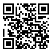
義工資訊網 Volunteer Link

「義工資訊網」透過不同的網上平台，包括網頁及社交媒體，為各界提供本地及海外最新的義務工作資訊。年內製作「義工專訪－『非組織義務工作』沙田交通關注組」專輯，透過訪談探討非組織義務工作的特質和發展，以及「聯合國志願人員組織－香港大學生義工實習計劃感想專輯」，分享海外義工實習的經歷和得著；並出版「Empathy 101－認識同理心」及「積極聆聽」參考指引，提升義工技能。「義工資訊網」於年內共錄得 18 多萬人次瀏覽。