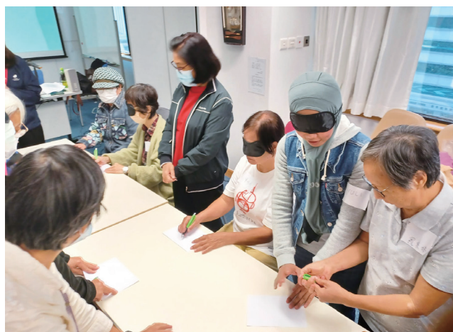
溝通及遊戲帶領技巧培訓 Training on communication and gamification techniques