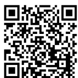
學院 YouTube 頻道 IoV YouTube Channel

學院致力發展多元化的培訓項目，除體驗式學習外，也開拓網上學習平台，並透過線上另類實境遊戲及互動短片等方式，提升網上培訓的效益，讓義工、義工領袖及管理人員能夠積極參與。學院亦繼續利用社交媒體平台，與市民分享行義精神及義務工作資訊，在提升義工專業知識的同時，亦融入法律及精神健康元素於行義生活。此外，為了讓學習付諸實踐，學院還開展了各種服務計劃，包括已全面恢復的「聯合國志願人員組織－香港大學生義工實習計劃」，以促進跨文化交流學習及服務的機會。