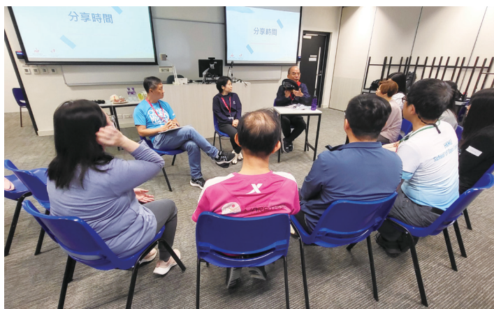
學院提供「真人圖書館」講座，向學生分享義務工作的經歷 IoV offered 'Human Library' talks to students on volunteering experiences