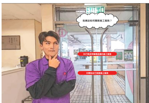
VR 虛擬實境網上遊戲 Online volunteer virtual reality game

學院於2023年推出虛擬實境遊戲，以互動形式提倡義務工作精神，培育尤其是年輕人的正面特質。過去一年，香港義工約章 — 「我的行義之旅」把抽象概念，如熱誠、尊重、誠信和理性，轉化為義務工作的生活實踐。年內錄得逾2,500人次參與。